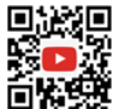
CRUSHING HARD MATERIALS

Didn't find your application? Please visit www.allu.net