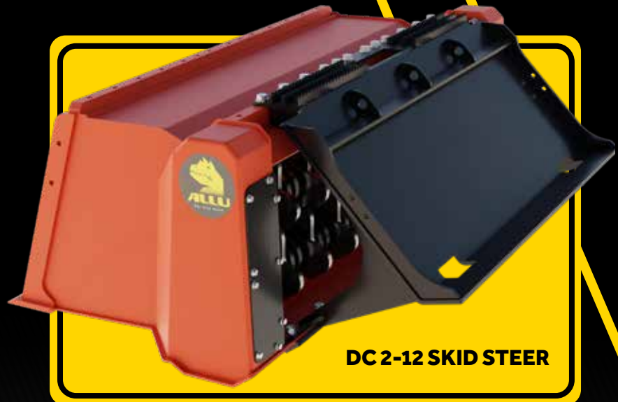
DC 2-12 SKID STEER

With the special adapter, the DC 2-12 will transform your lightweight fleet to multifunction tools in material processing.